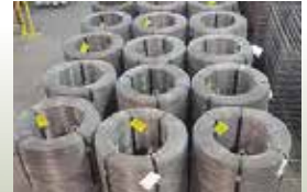
Cold Drawn Wire