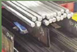
Cold Finished Bar