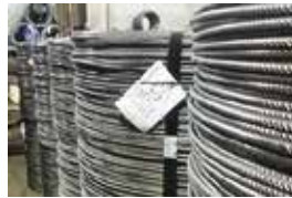
Deformed and Smooth Wire