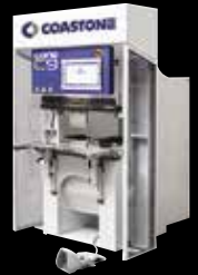
C - SERIES 34" X 25 TON To 64" x 50 TON

SERVO-MOTOR BALL SCREW • LOWER OPERATING COSTS • ECOLOGICALLY FRIENDLY • MADE IN FINLAND • SOLD WORLDWIDE