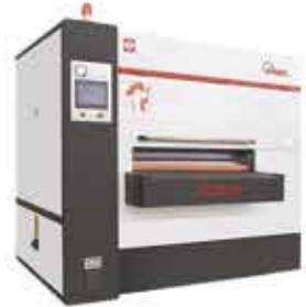
METAL DEBURRING & FINISHING