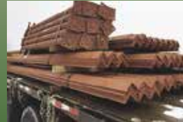
Painted Beams, Lintels and Posts