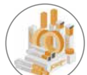
WELDING WIRE & ELECTRODES