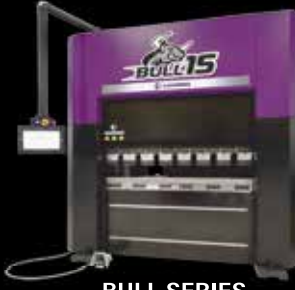
BULL SERIES 52" X 110 TON or 64" x 160 TON