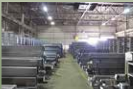
Hollow Structural Steel (HSS)