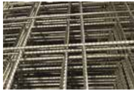
Mesh Rebar and Rolls