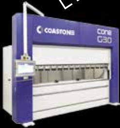
G - SERIES 80" X 67 TON To 160" x 165 TON