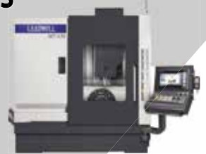
MU SERIES Optimized Structure for Stable Moving Dual Nuts Ball Screw Design in X and Y Axis Three Axis Roller Type High Rigidity Guide Way

MODERN TOOL HAS A COMBINED INVENTORY OF OVER 600