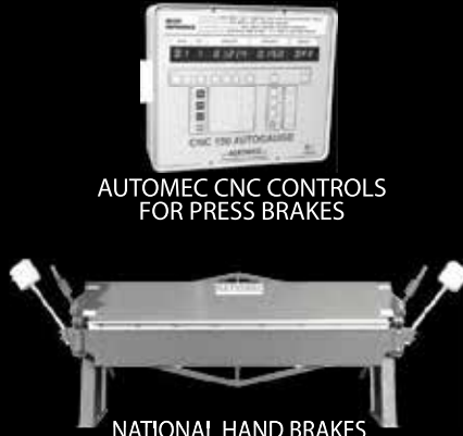
AUTOMECC CNC CONTROLS FOR PRESS BRAKES