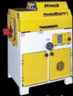
Rotoburr Single End Deburring Machine 1/2" - 6" O.D. Max