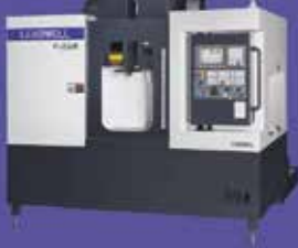
VE SERIES Vertical /High Efficiency Linear Way V-22iF(iR) / V-30iF(iR) V-32iF(iR) / V-32AF(AR) V-42iF(iR) / V-42AF(AR)