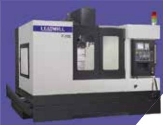
NV SERIES Vertical /High Performance Linear Way V-12iP - V-20S / V-30S V-30M / V-40M - V-40L / V-50L V-60S - V60i/V80i