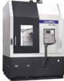
VTL SERIES -High Rigid Of Cross Roller Guide Way Enables Heavy Cutting -AC Servo Motor & High Accuracy Roller Ball Screw, Direct Drive As Well As Pretension, Enhance Repeatability and Positioning Accuracy -High Rigit Construction, Base Close To Square Design, Less Vibration, -2 Axis