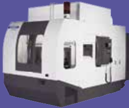
LC SERIES 3 Axe Moving Column LCH-500/LCV-760