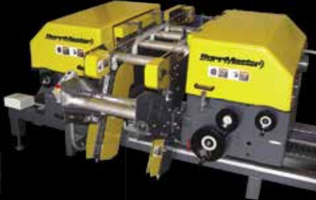
BurrMaster Double End Tube Deburring Machine 1" - 80 Ft, Up To 8" O.D. Round

Semi-Auto and Fully Automatic Deburring Machines