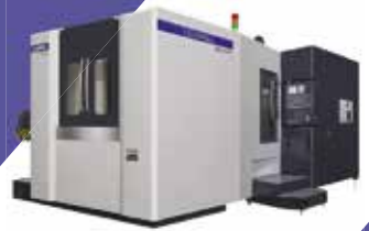
2 Axes Moving Column MH-500i/MH-630