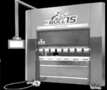
COASTONE CNC ELECTRIC PRESS BRAKES