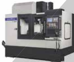
IT SERIES High Rigidity Structure Design Rollar Type Guide Way 3 Axis Ball Screw Prestressing