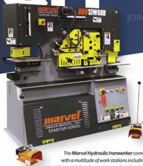
The Marvel Hydraulic Ironworker comes with a multitude of work stations including stations for round shearing, square section shearing, angle shearing, flat bar shearing, u-notching and angle section (45 Degree) shearing. Features a central lubrication pump and electrical back gauge. Available in either single or dual operator.