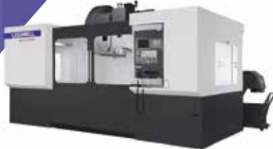
MCV SERIES Vertical /Heavy Duty Box Way MCV-1300iSM MCV-1500i/MCV-1500i+ MCV-2000i