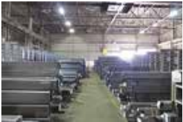
Hollow Structural Steel (HSS)