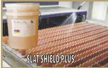
SLAG SHIELD PLUS