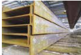
Wide Flange Beams