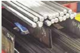
Cold Finished Bar