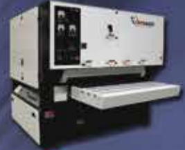
Sanding & Deburring