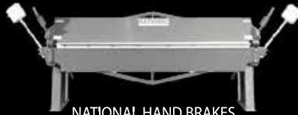
NATIONAL HAND BRAKES AND SHEARS