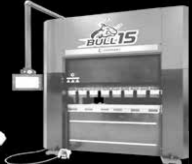
COASTONE CNC ELECTRIC PRESS BRAKES