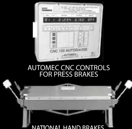
AUTOMECC CNC CONTROLS FOR PRESS BRAKES