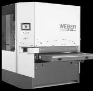
WEBER DEBURRING & EDGE FINISHING MACHINE