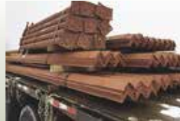
Painted Beams, Lintels and Posts