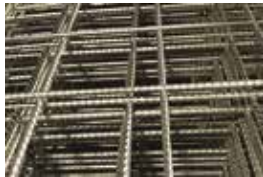
Mesh Rebar and Rolls