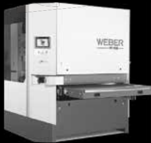
WEBER DEBURRING & EDGE FINISHING MACHINE