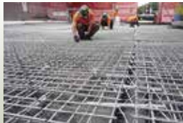
Glass Fibre Reinforced Polymer (GFRP)