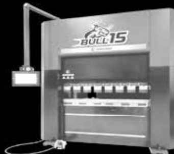
COASTONE CNC ELECTRIC PRESS BRAKES