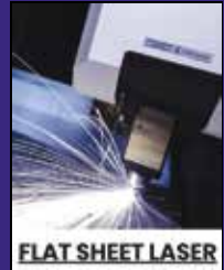
FLAT SHEET LASER

We can help with all your welding needs.