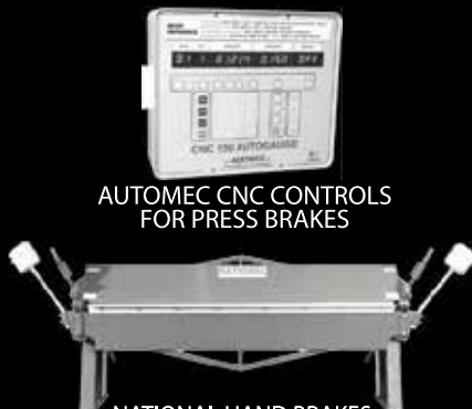
AUTOMECC CNC CONTROLS FOR PRESS BRAKES