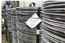
Deformed and Smooth Wire